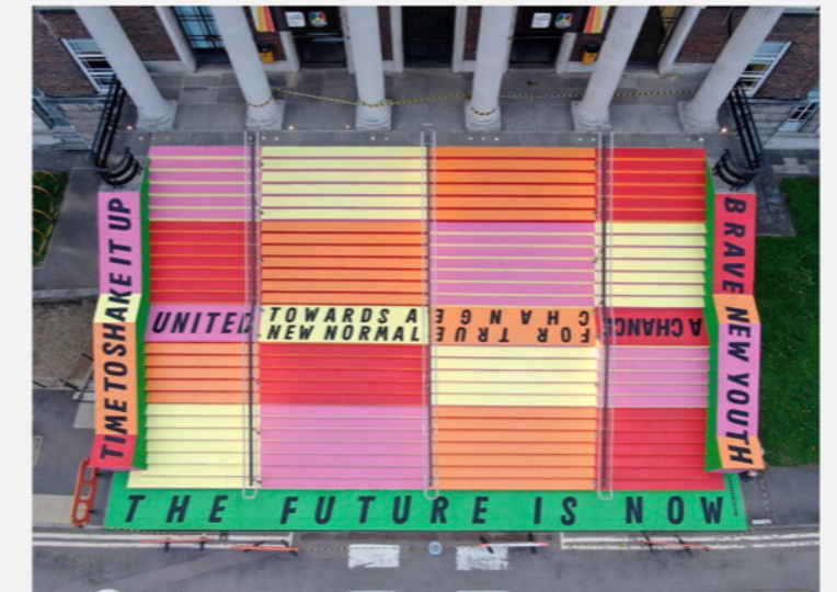
The Staircase of Dreams, London Design Festival 2020, uniting collective voices on daily activism

“Towards a new normal” is the title of the new public artwork by artist The Fandangoe Kid and students from the Waltham Forest College, unveiled during London Design Festival 2020.