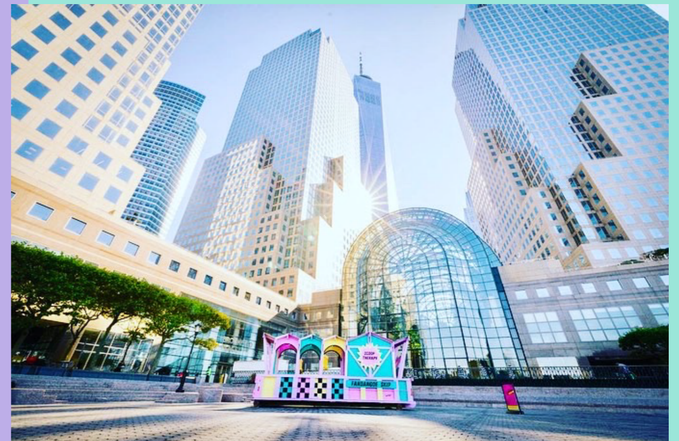
The Fandango Skip, World Trade Center. A touring installation with a collective mental health + grief programme